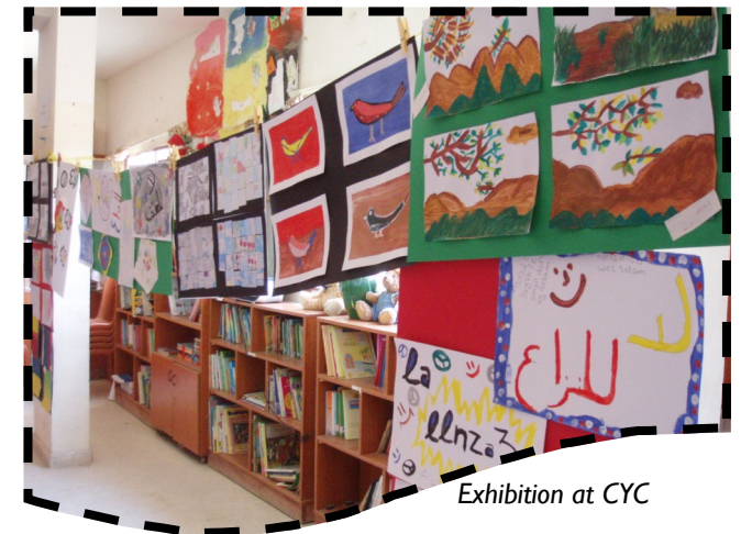
Exhibition at CYC

"The idea is [...] through conversation with the camps residents and the experience of daily routines, guests get a personalized look at life in a refugee camp."